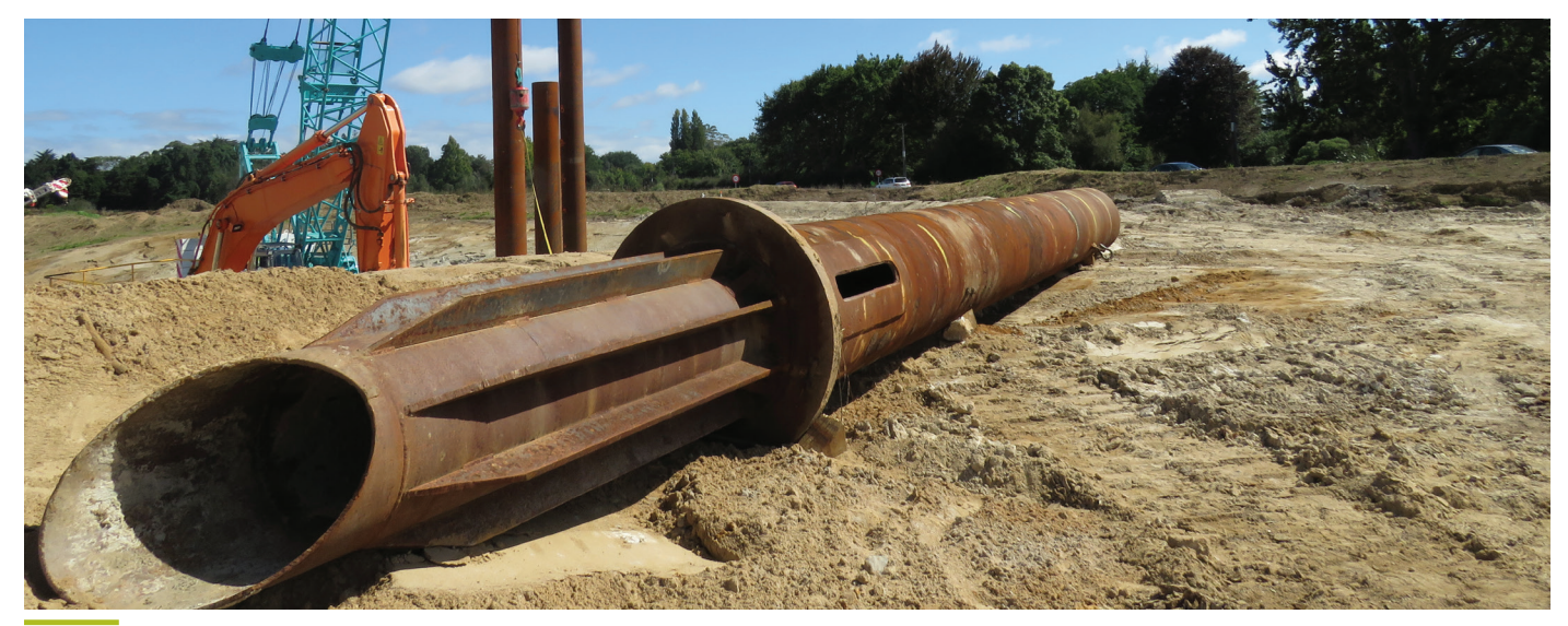
This driving dolly is used to test piles when they achieve their target depth