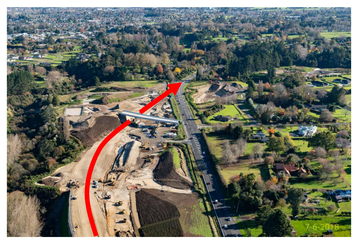
We're building two new lanes to run from the Airport Road Interchange, under the East West Link Bridge, reconnecting with SH1 at the top of the gully near the 'Hamilton' billboard. The red line shows where these lanes are being constructed. The new lanes will be sealed in October/November and SH1 traffic switched on to these lanes. The old highway will be closed north of Cherry Lane.