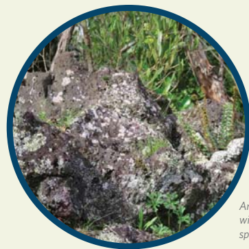
Anns Creek East, lava shrubland with akeake, Geranium and fern species on lava flow