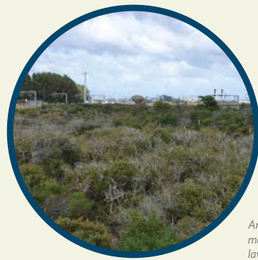
Anns Creek East, mosaic of mangrove saltmarsh and lava shrubland