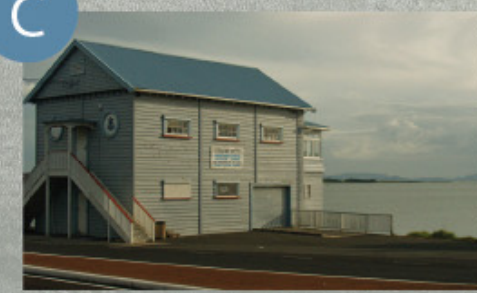
AOTEA SEA SCOUTS BUILDING