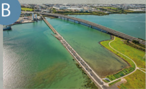
OLD MĀNGERE BRIDGE