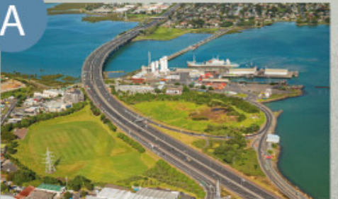
GLOUCESTER RESERVE/ SALT MARSH / TUFF RING