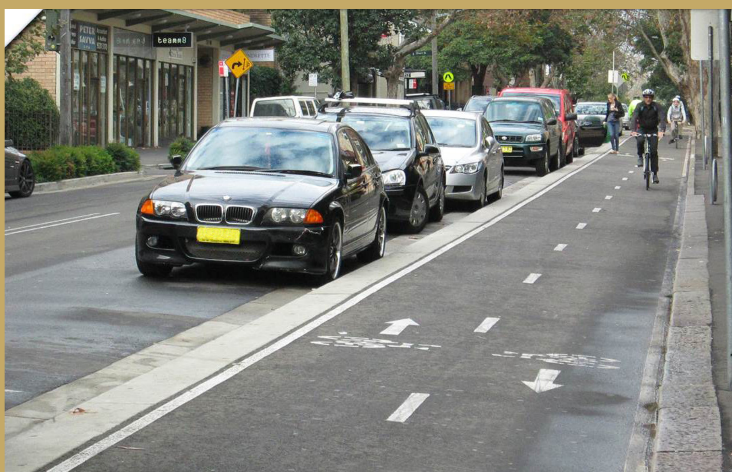
Bourke Street in the CBD