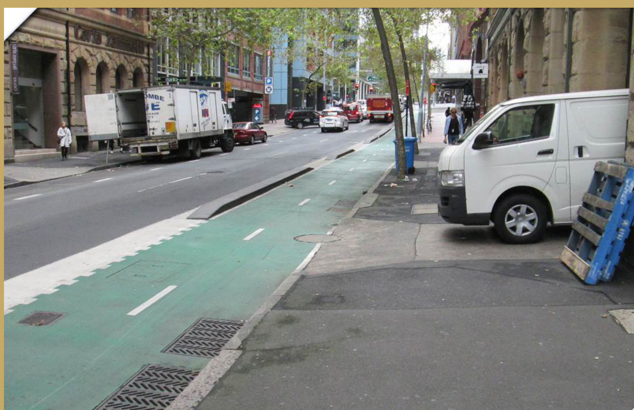
Kent Street cycleway in the centre of the city