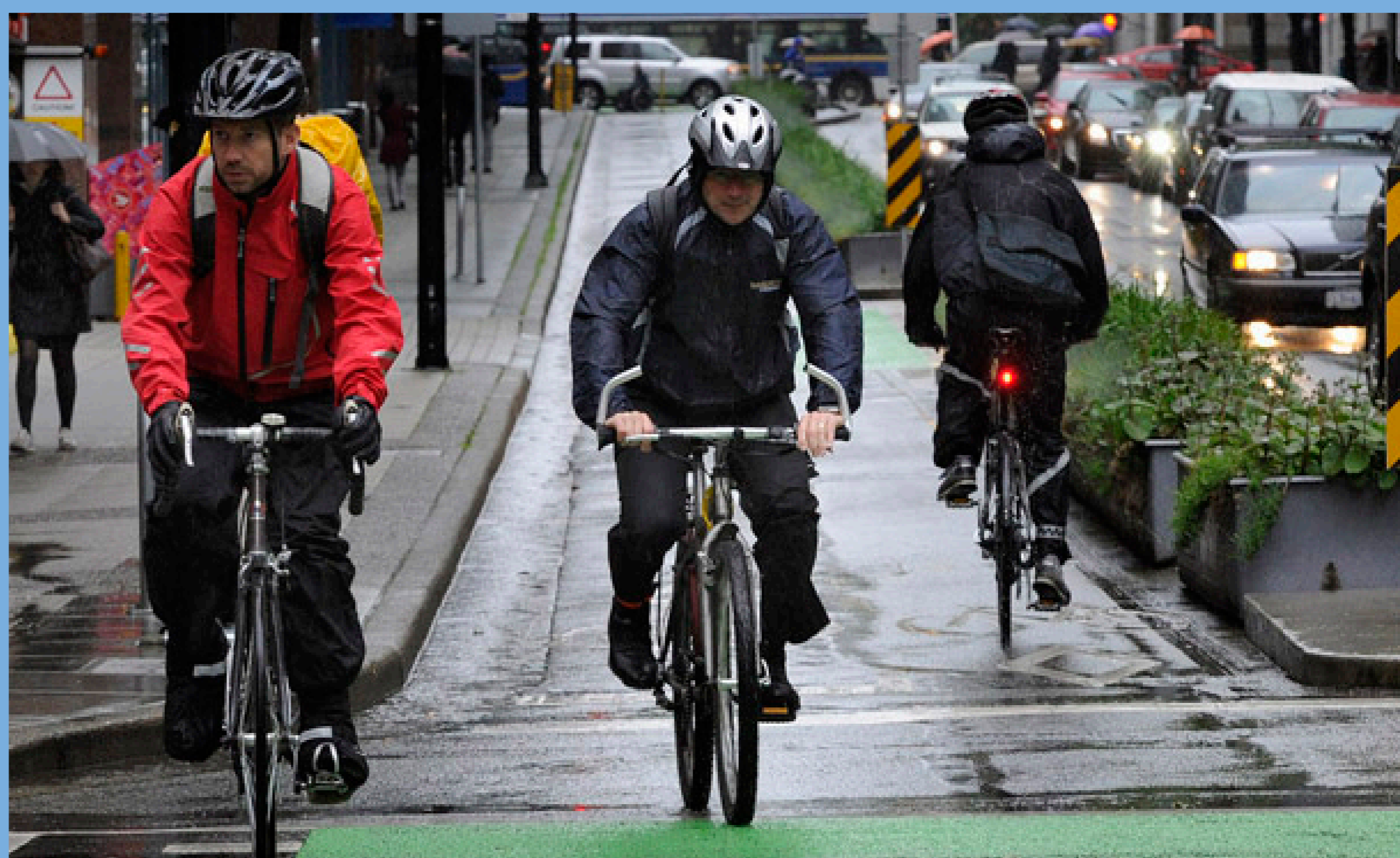
Planters are used to separate cyclists