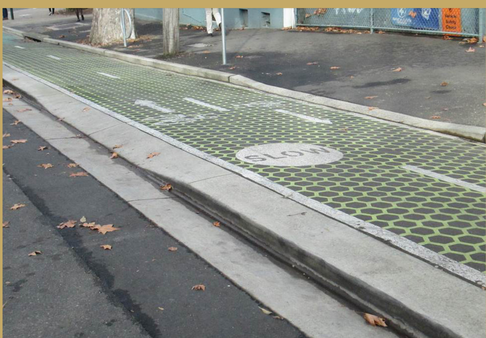
Adjoining property access treatment