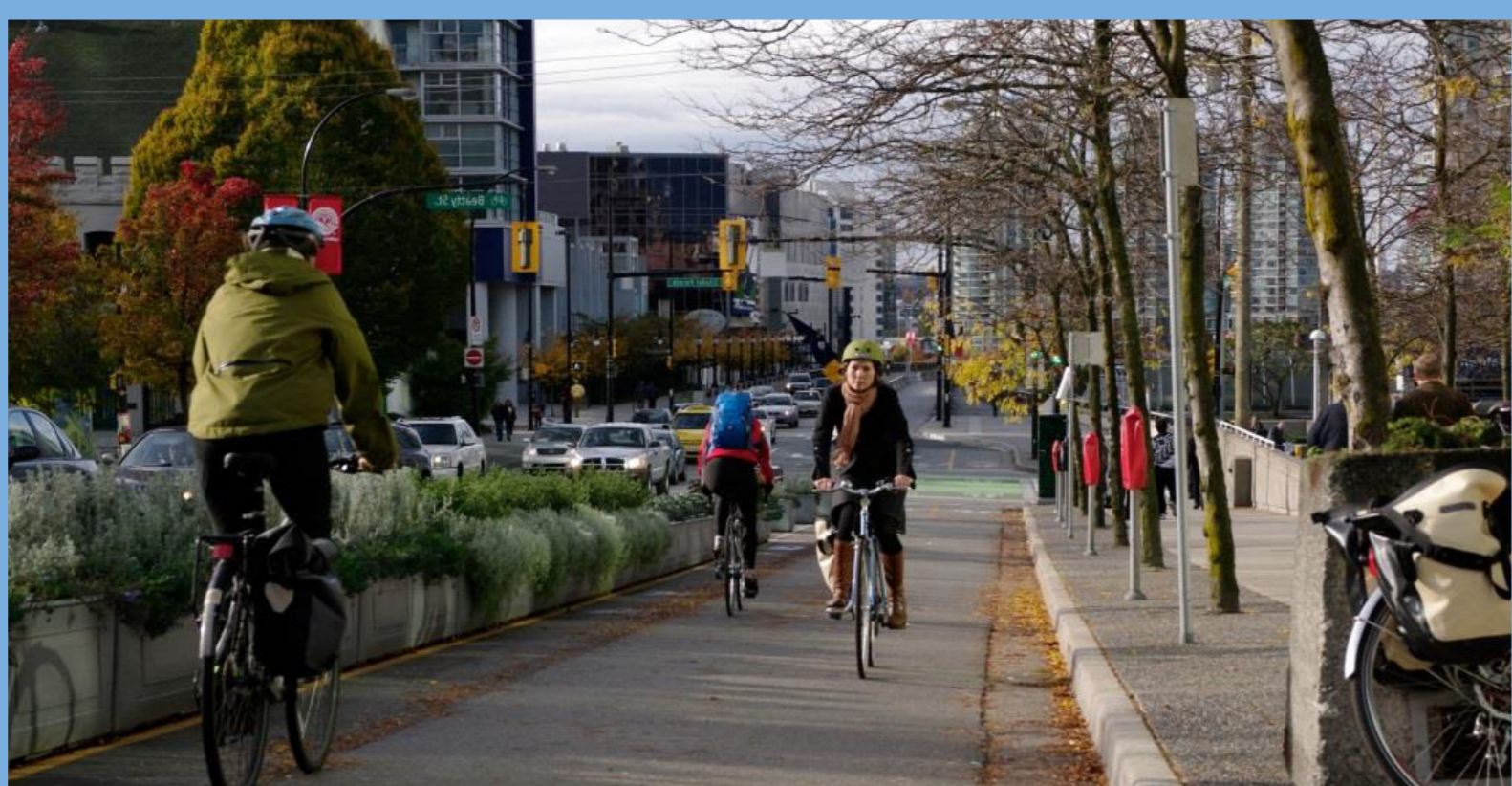
A separated cycleway