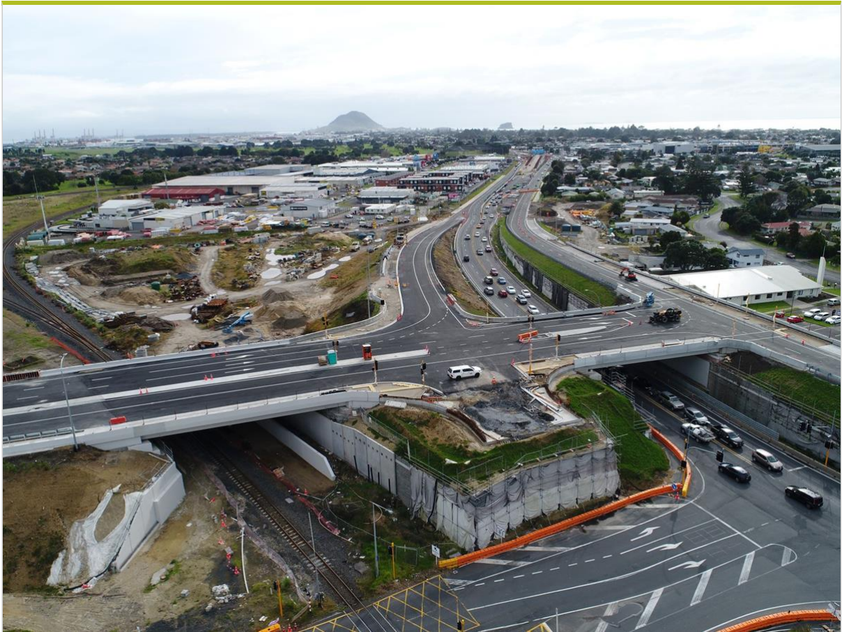
SH2/29A Te Maunga interchange in early June 2022

Now, Te Maunga is home to a new roundabout on SH29A, two bridges and three of the four 'legs' of the interchange (pictured above). Work to complete the fourth leg, the Tauranga Eastern Link (TEL) off-ramp, will commence once the interchange has been partially opened.