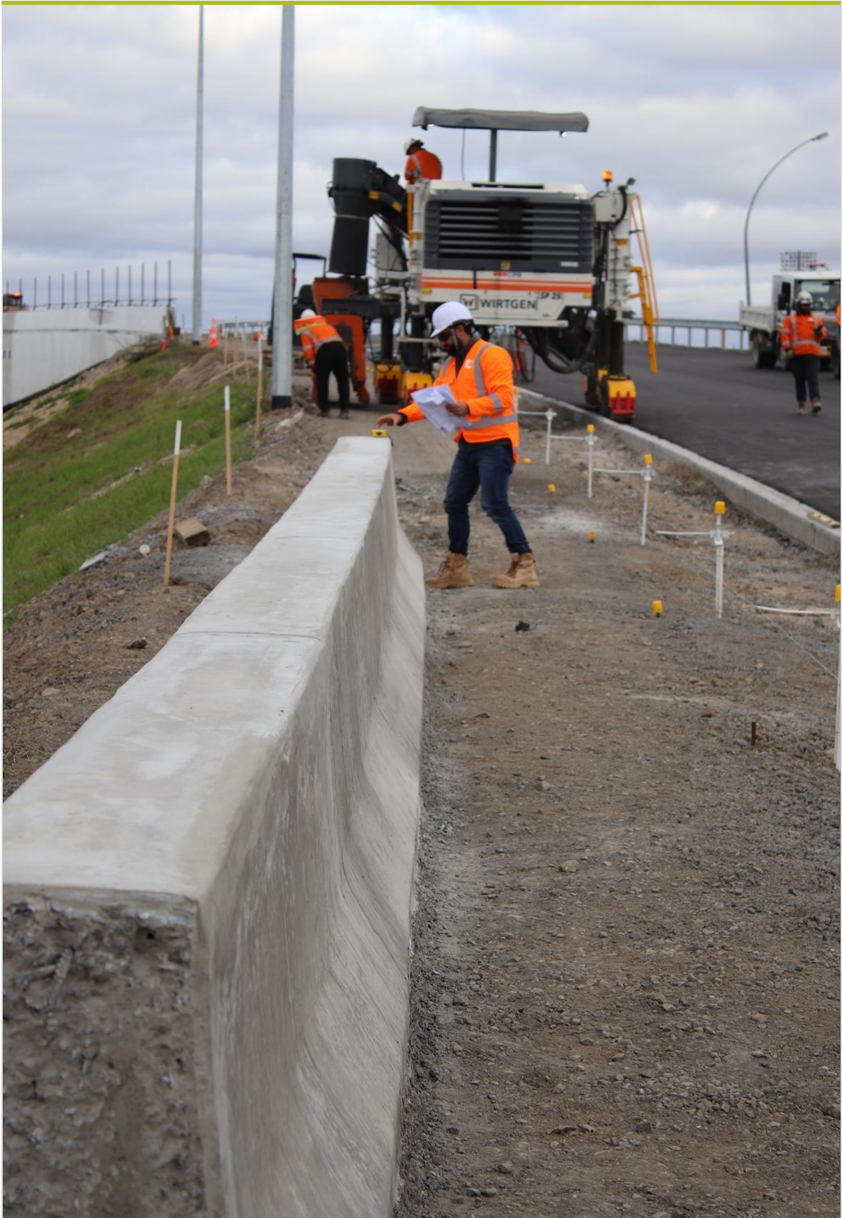
The slipform paver machine leaving a line of freshly minted barriers in its wake

The interchange has also been home to a slipform paver machine over the last few months. This specialist piece of German machinery, believed to be one of few of its type in New Zealand, has been used for barrier construction. Unlike precast barriers (which are manufactured offsite) or in situ barriers (where concrete is poured into stationary formwork on site), the slipform machine produces barriers while in motion. Concrete is added to one