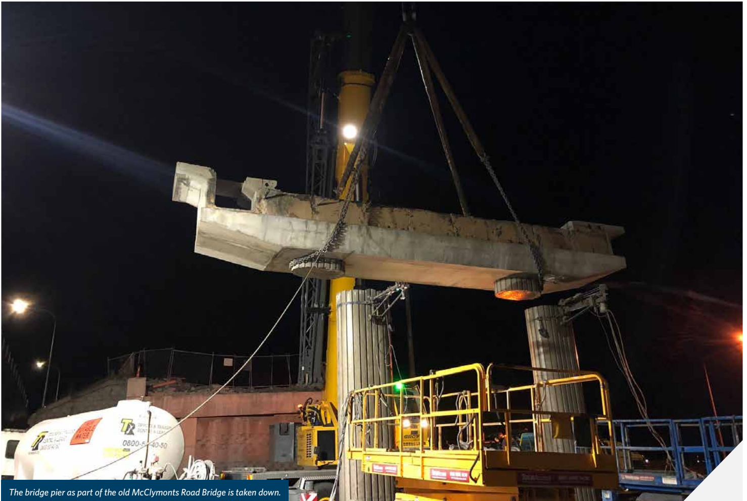
The bridge pier as part of the old McClymonts Road Bridge is taken down.