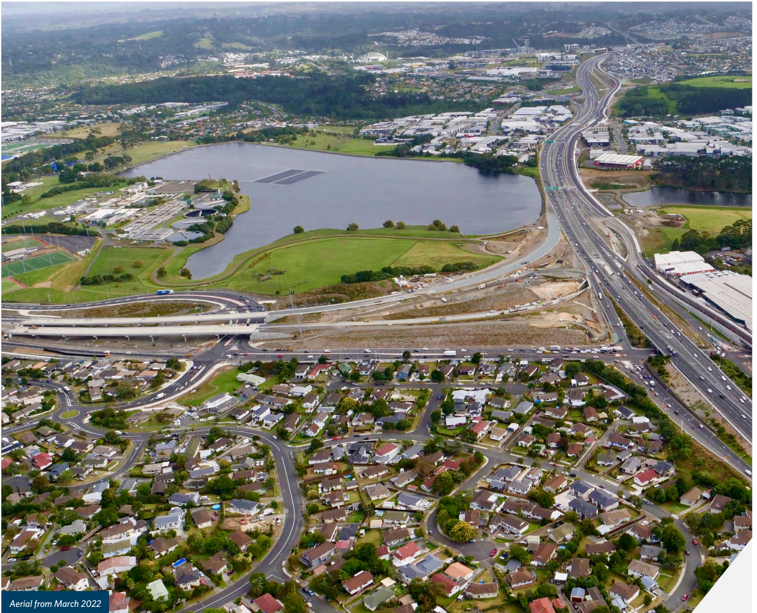
Aerial from March 2022

It's an exciting year for Aucklanders as 2022 will see the opening of several transport upgrades on the North Shore.