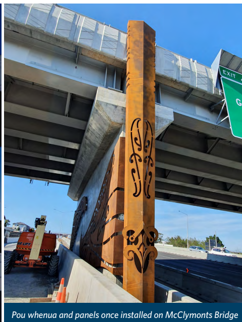
Pou whenua and panels once installed on McClymonts Bridge