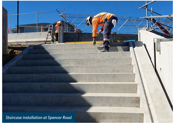
Staircase installation at Spencer Road