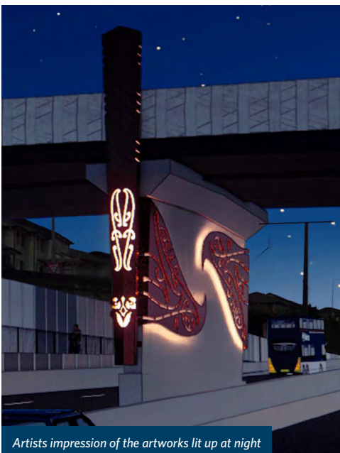
Artists impression of the artworks lit up at night