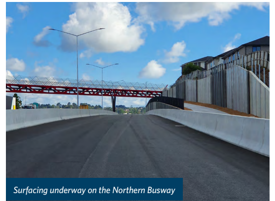
Surfacing underway on the Northern Busway

In a few months, the approx. 5km extension of the busway will be open in both directions, extending the network of reliable public transport on the North Shore all the way to Albany.