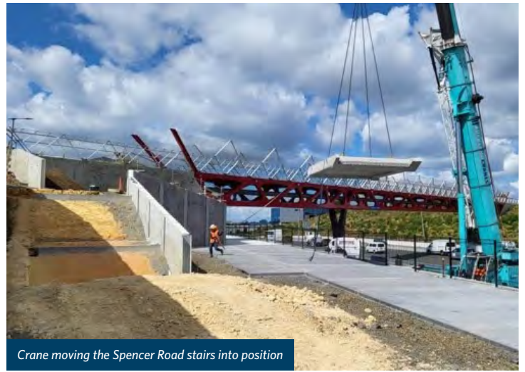
Crane moving the Spencer Road stairs into position