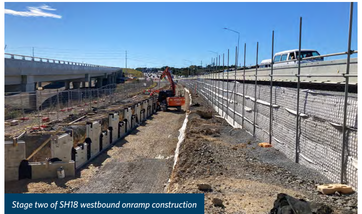
Stage two of SH18 westbound onramp construction