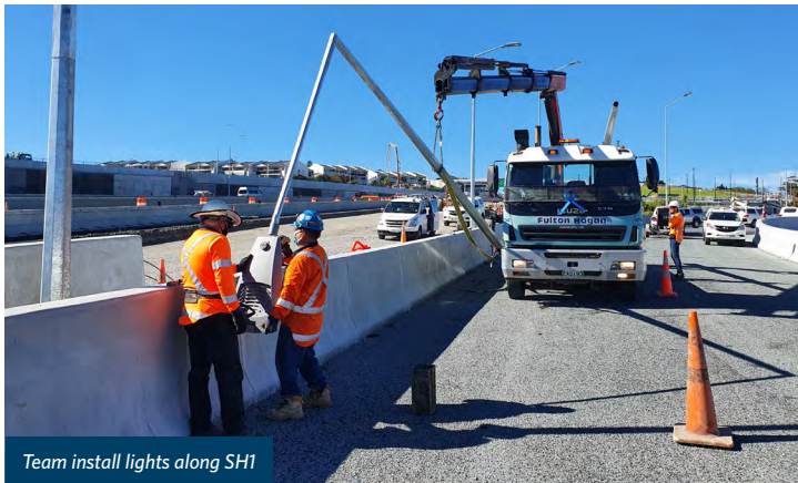
Team install lights along SH1