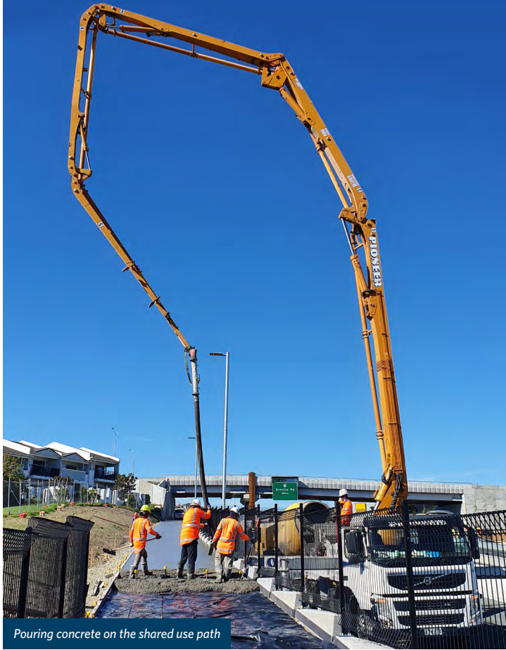
Pouring concrete on the shared use path