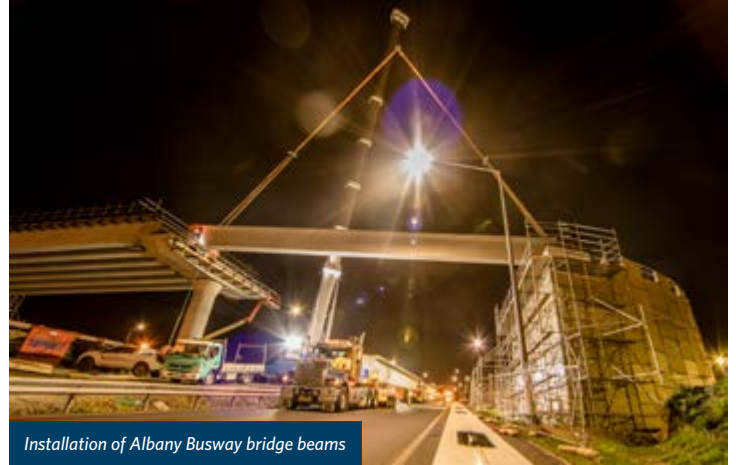
Installation of Albany Busway bridge beams