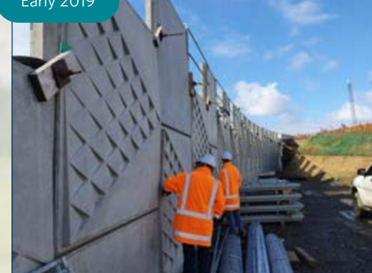
Retaining wall leading to the entrance of the underpass was constructed in early 2019.