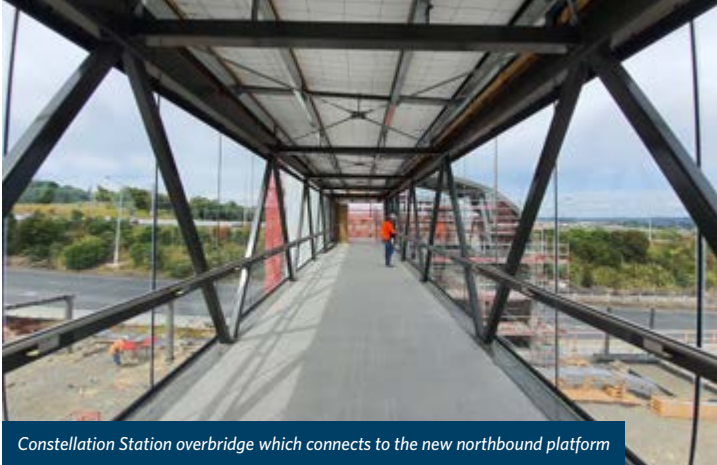
Constellation Station overbridge which connects to the new northbound platform