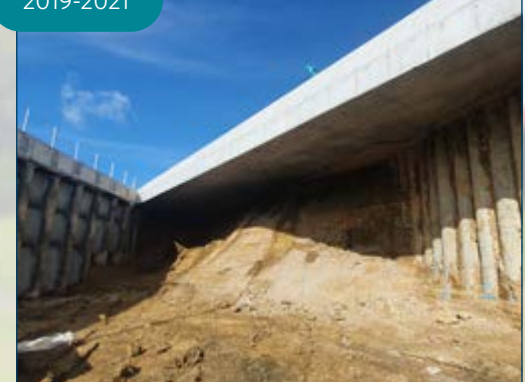
Construction followed a 'top-down' method where the piled walls and roof slab are built first.