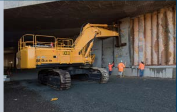
Concrete panels, which measure 8m in height and weigh up to 13 tonnes will line the walls of the underpass and we've recently started putting these in place.