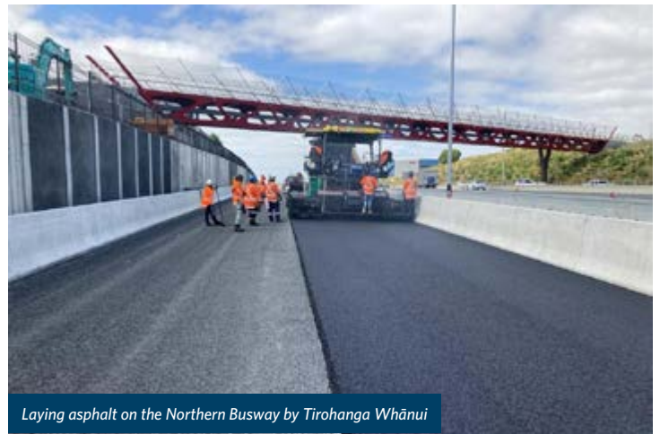
Laying asphalt on the Northern Busway by Tirohanga Whānui