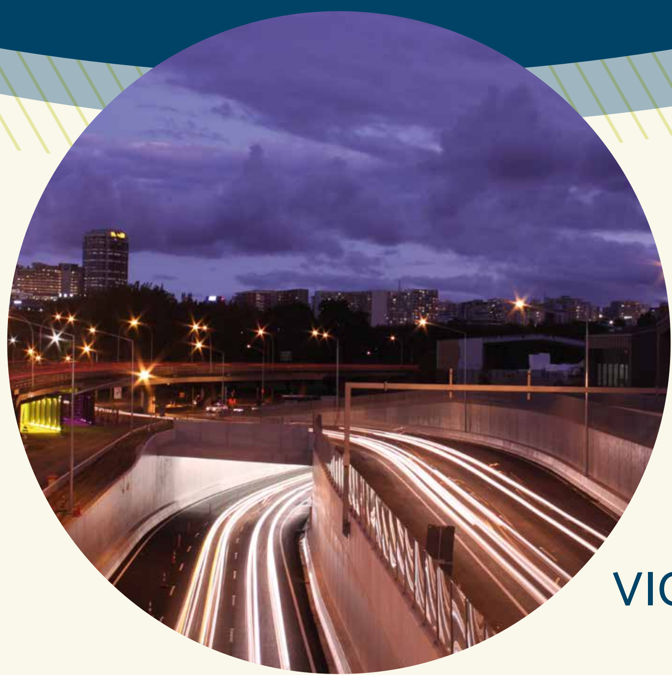
VICTORIA PARK TUNNEL $340m, completed 2012.

A key part of the Government's National Infrastructure Plan, the programme aims to complete essential state highway projects to reduce congestion, improve safety and support economic growth.