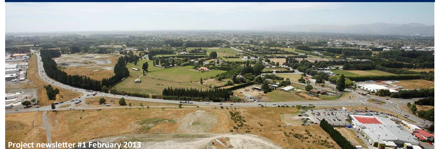
Project newsletter #1 February 2013

Aerial photograph of Johns Road. The Harewood Road roundabout is to the right of the photograph.