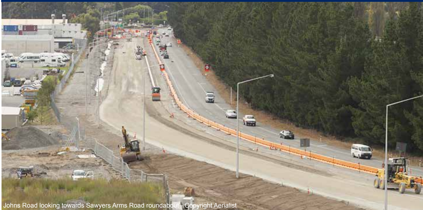
Johns Road looking towards Sawyers Arms Road roundabout

We are a third of the way through the construction of the new road layout for Johns Road, between Sawyers Arms Road and Harewood Road.