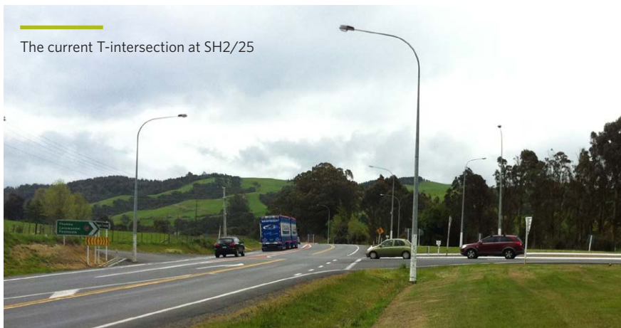
The current T-intersection at SH2/25