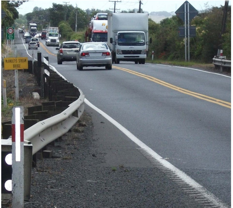
Busy highway: On average 13,000 vehicles use SH2 around Maramarua each day, and holiday peaks climb to 24,000.

A public Open Day will be held towards the end of May/early June 2014.