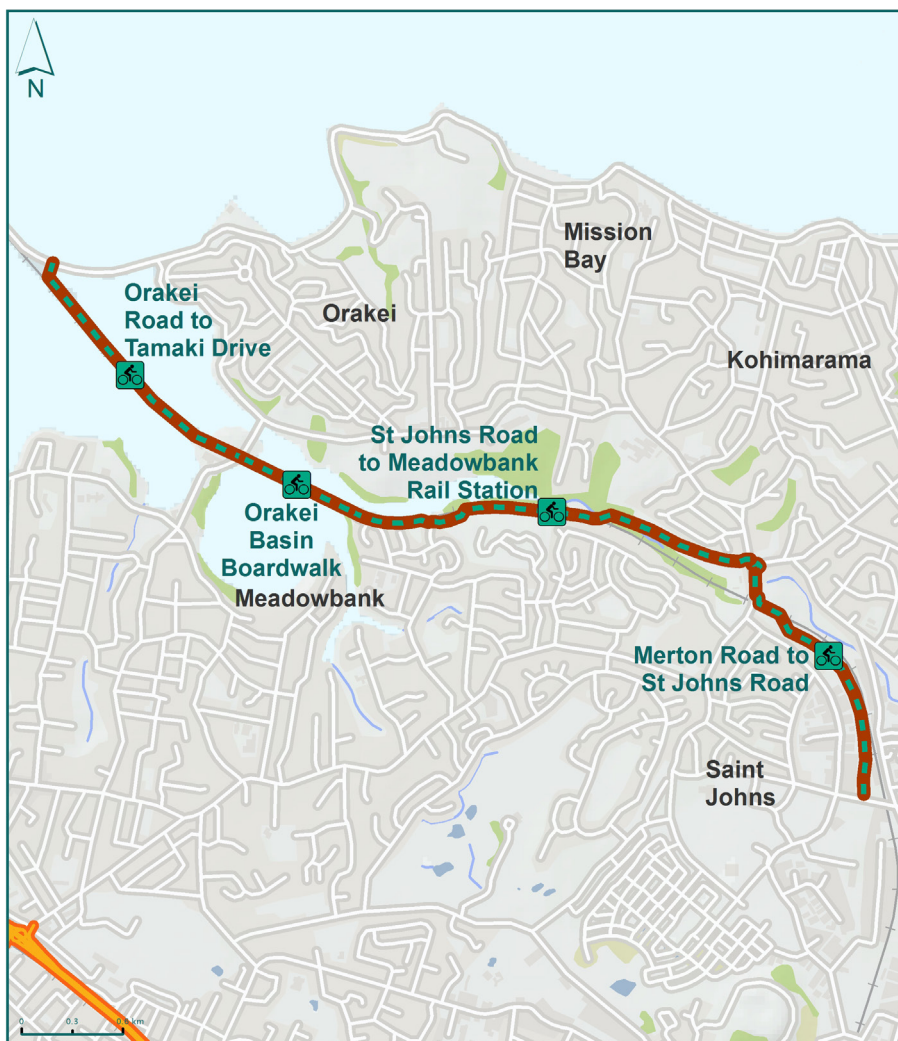
Glen Innes to Tamaki Drive Cycleway Design