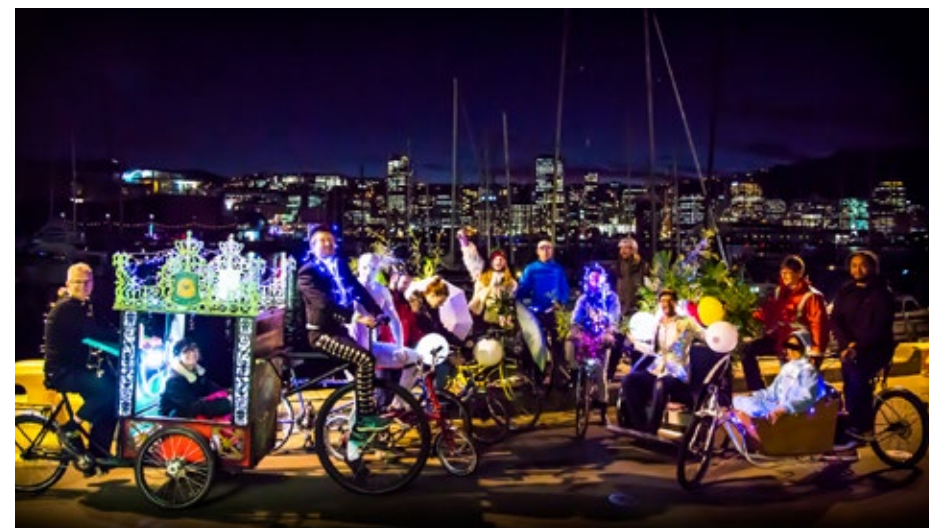
Lucid Dreambike, Wellington