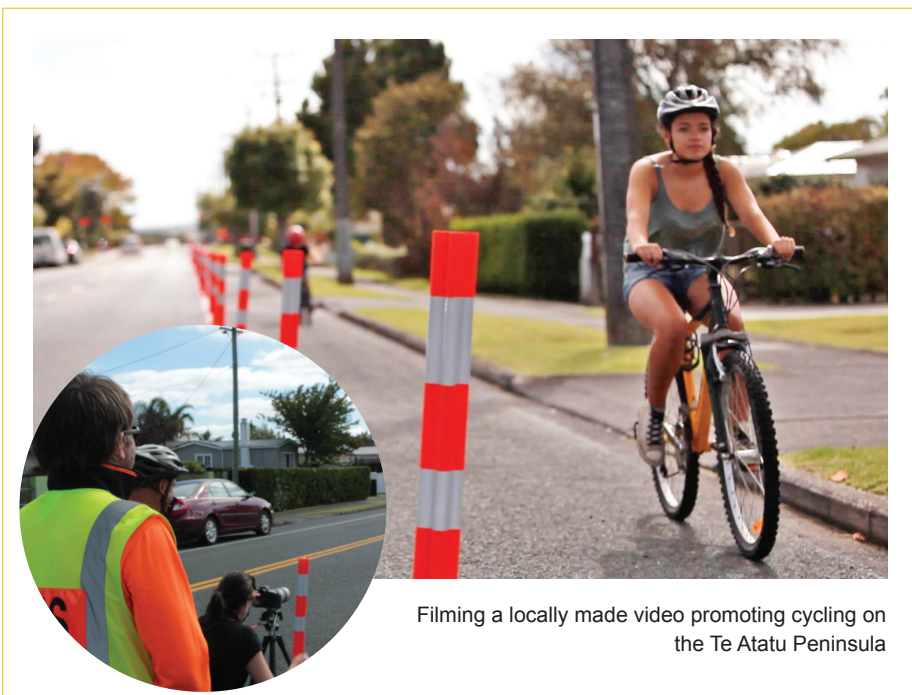
Filming a locally made video promoting cycling on the Te Atatu Peninsula

You can view the end result on line at https://www.youtube.com/watch?v=NoXKJUFhNcs .