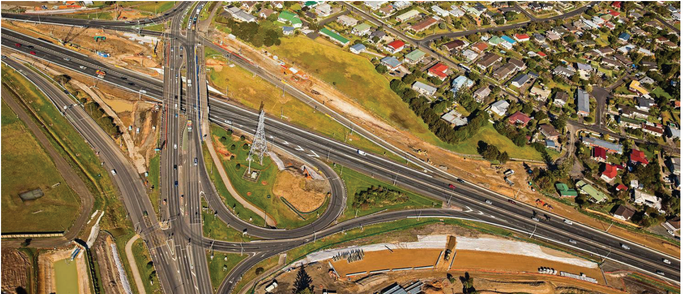
The Te Atatu Interchange with McCormick Green upper right