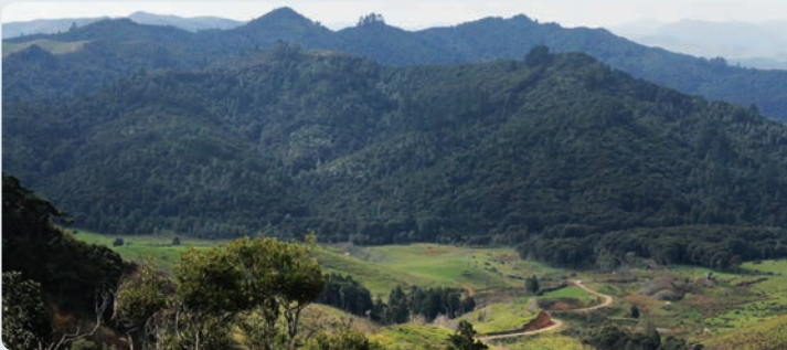
Taupiri Scientific Reserve

"We are pleased with how the various stakeholders have worked together to achieve a good outcome which balances the Transport Agency's objectives for the construction of the Expressway with the mitigation of the ecological effects."