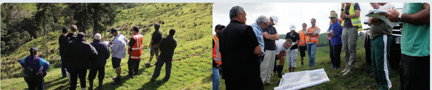
NZ Transport Agency consultants discuss the Huntly Section with Tangata Whenua Working Group members

"The Transport Agency has benefited from the working group by gaining a clear understanding of our concerns and ideas. We look forward to maintaining the excellent relationship as the project now moves from the investigation and design stage into construction and beyond."