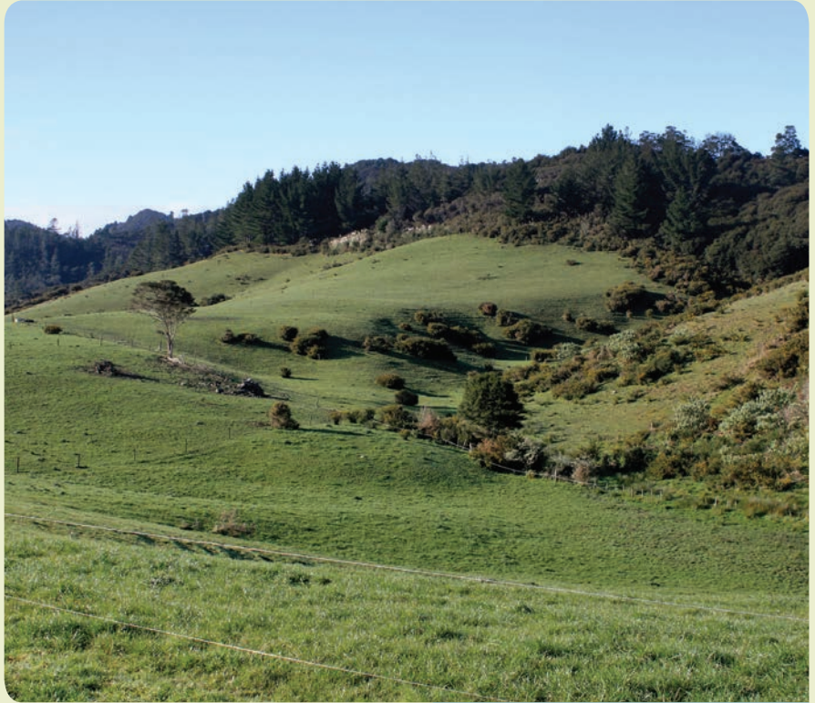
Planned Gun Club site on Evans Road

The Evans Road property was purchased by the Crown in 2008 for this specific purpose.