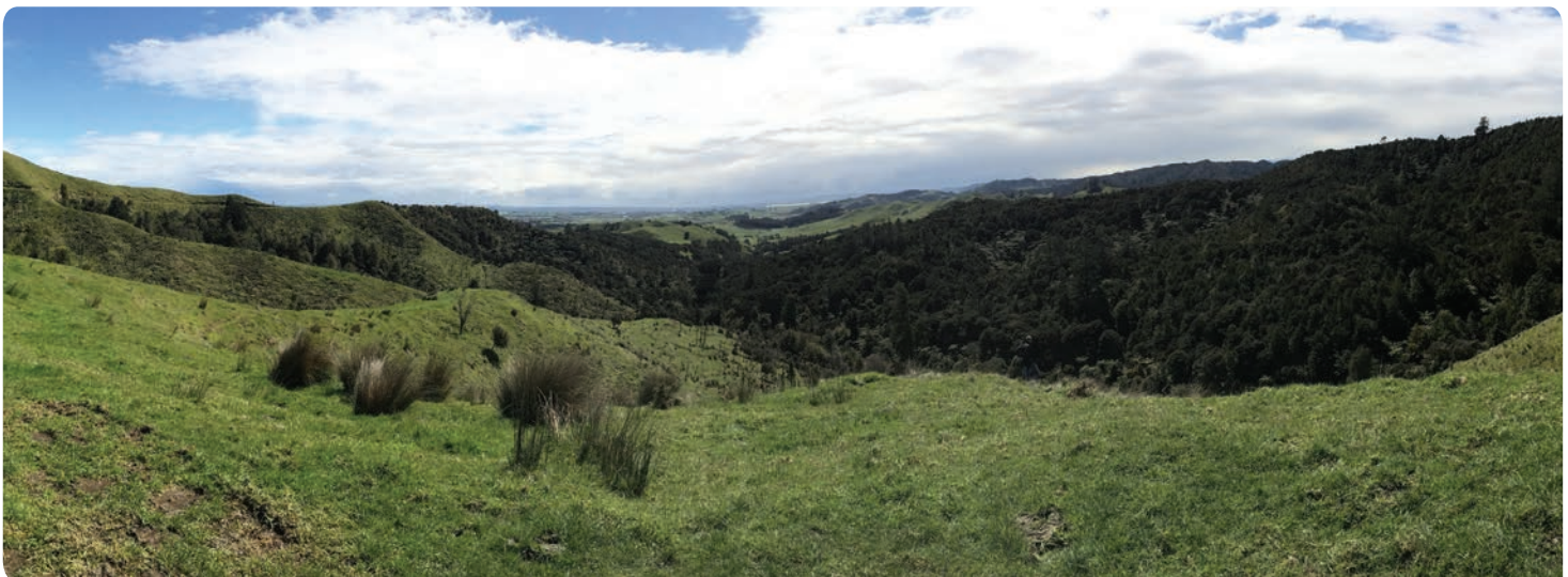
View of alignment looking north from Taupiri Range

“The good progress to date has been the direct result of collaboration with the Tangata Whenua Working Group and following consultation with the community, councils, landowners and key stakeholders over the past three years.”