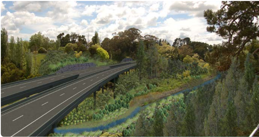
Artists impression of Mangaone gully crossing in Tamahere