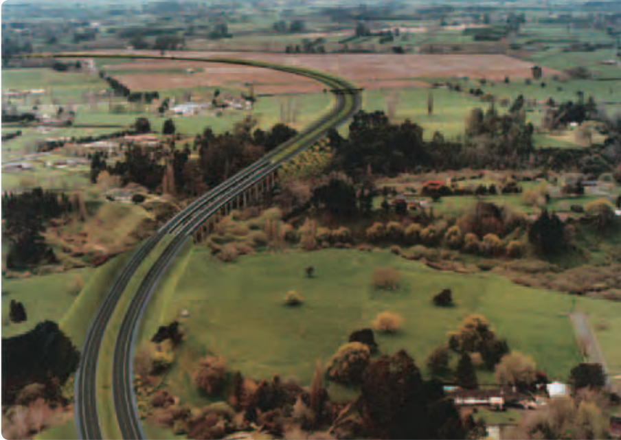
Possible bridge crossing of Mangaharakeke and Mangaone gullies in Tamahere (artist's impression of aerial view looking north).