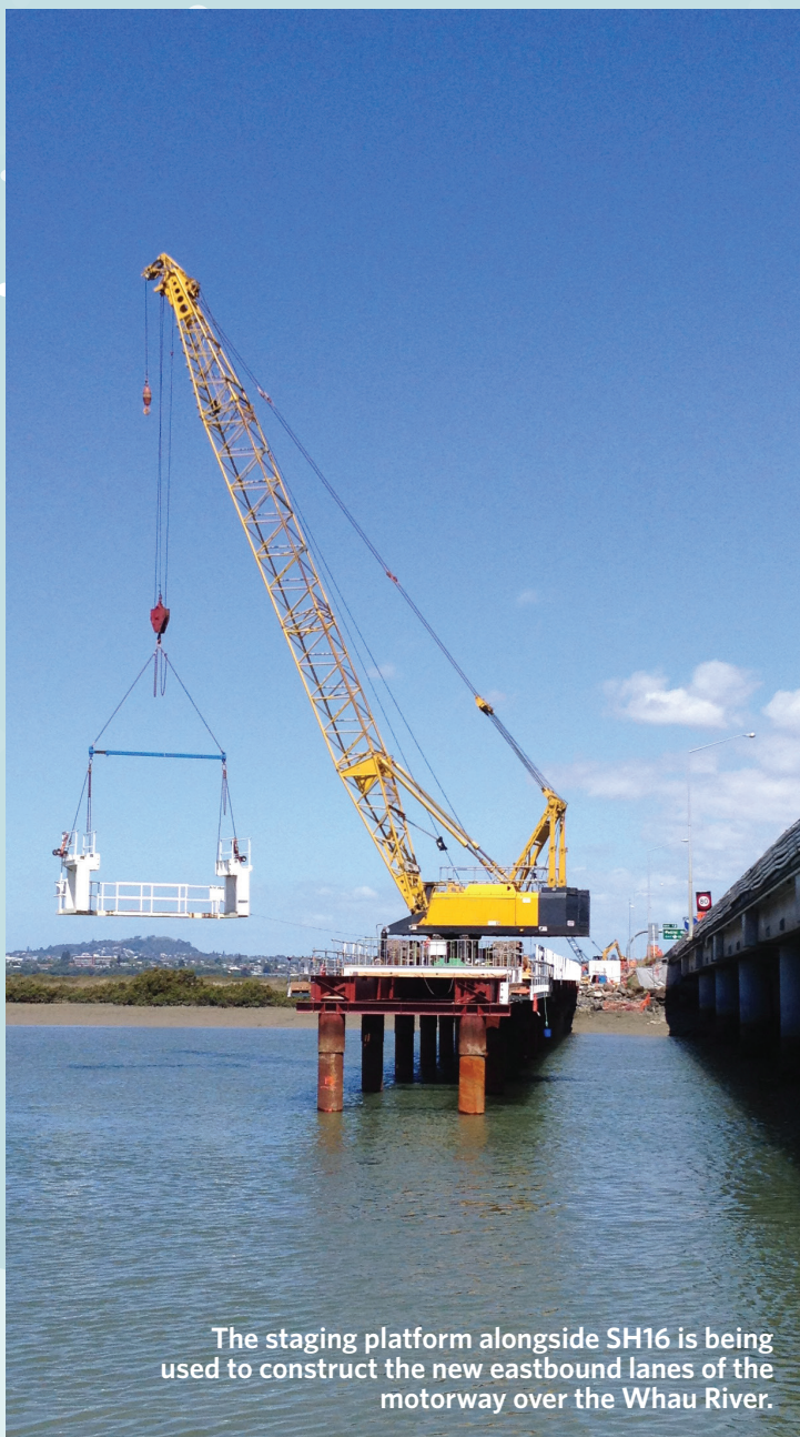
The staging platform alongside SH16 is being used to construct the new eastbound lanes of the motorway over the Whau River.

Let's not get confused or bewildered by this, Instead - please do know that your openness in meetings and consults and chats through the year have given us feedback, which we value and hear.