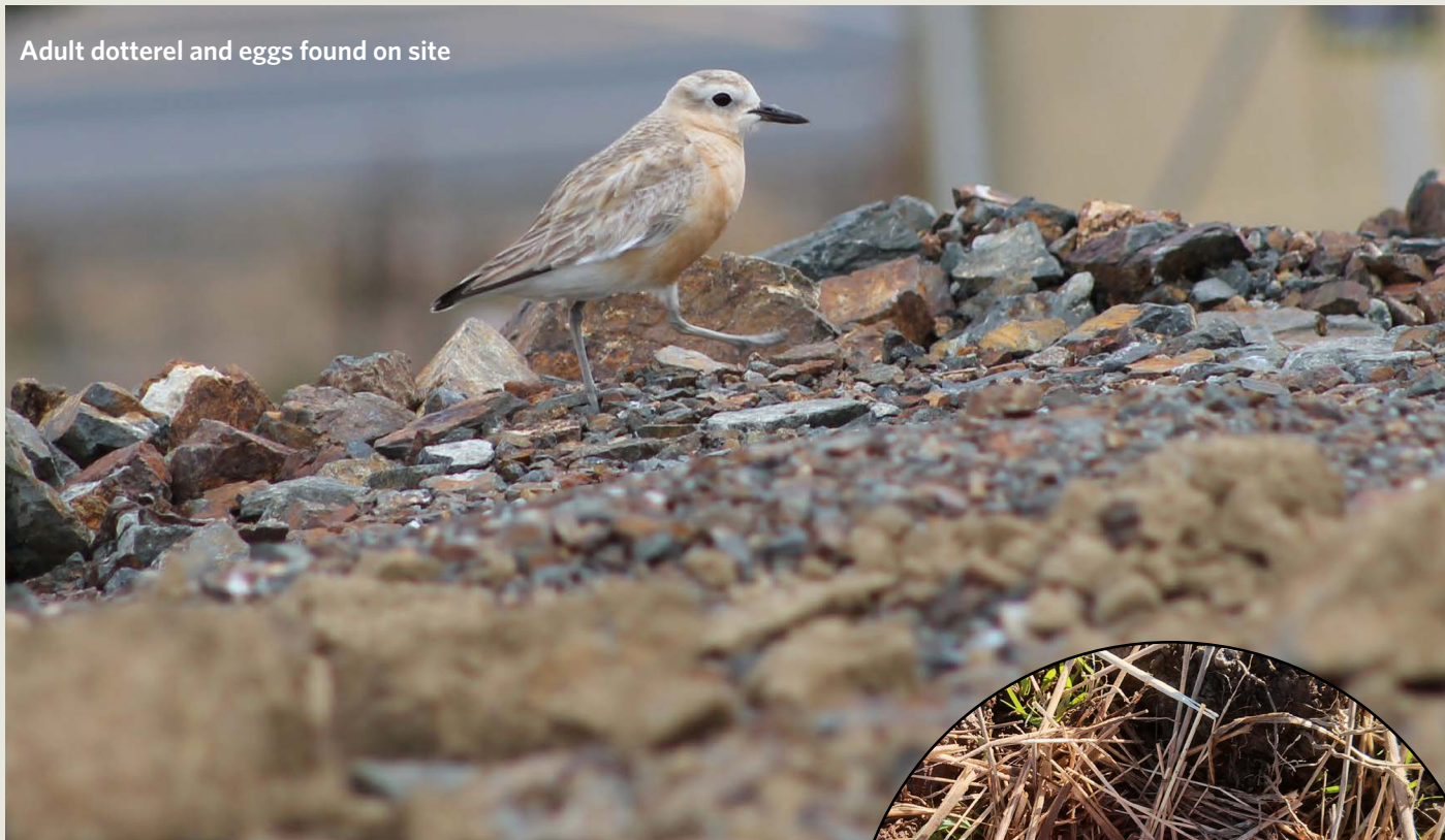
Adult dotterel and eggs found on site

www.doc.govt.nz/Documents/conservation/native-animals/birds/nzdotforweb.pdf