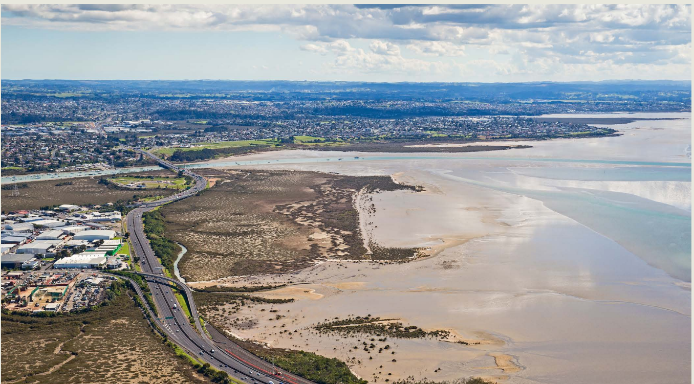
View towards Te Atatu Peninsula with SH16 in the foreground.