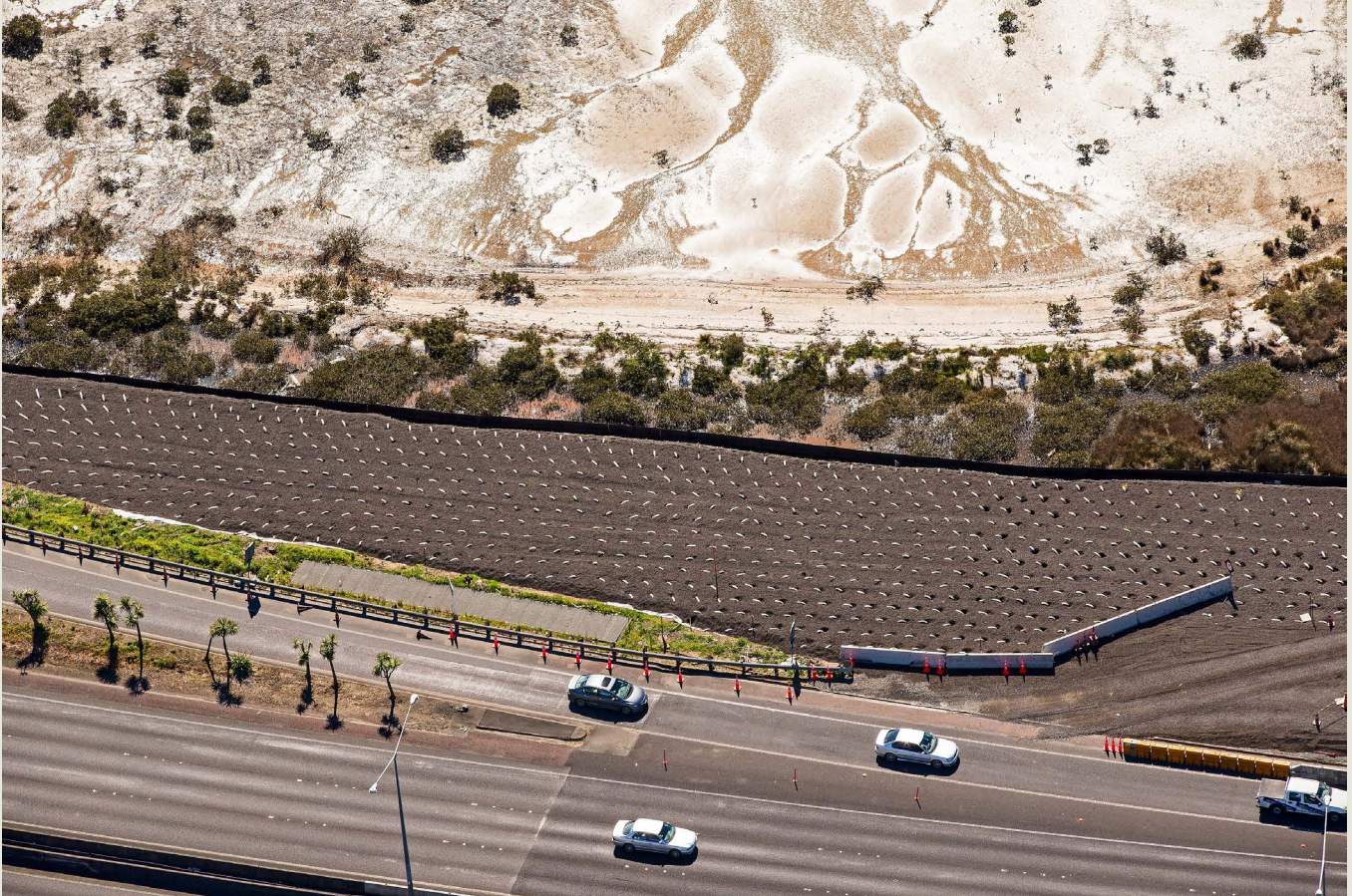
Close proximity - SH16, wick drains and Motu Manawa marine reserve at low tide.

The beautiful marine reserve environment of Motu Manawa (Pollen Island) where we are working is a constant reminder to us of the vital need to protect it. At the same time, we are mindful of the risks to our people who are working beside the tidal area as well as close to motorway traffic. In addition to our regular personal and environmental safety gear, our equipment lists include auto-inflating, self-righting life jackets fitted with emergency whistles and flashing lights for night use, as well as sea and river spill kits, air quality and noise monitors, vibration meters and inclinometers to measure ground movement.