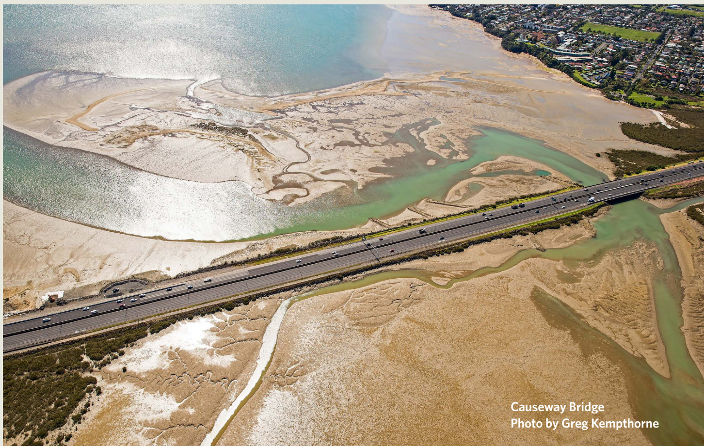
Causeway Bridge