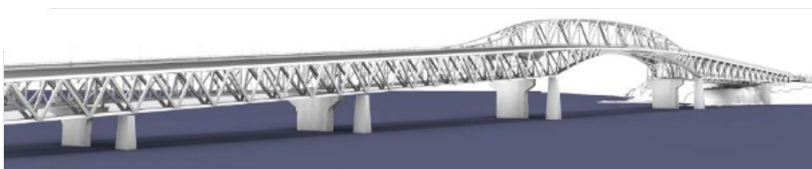
Figure 2 – potential view of dedicated walking and cycling pathway across Waitematā Harbour

Figure 1 above and Figure 2 below show the potential look and feel of the standalone structure alongside the existing Auckland Harbour Bridge.