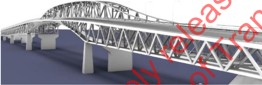
Figure 1 – potential view of dedicated walking and cycling pathway across Waitematā Harbour

The recommended solution is a full-height separate bridge option. It presents the best performing long-term solution as it provides a dedicated 24/7 cross harbour connection, a high level of amenity for users and can meet forecasted demand (with scope for further growth in demand)