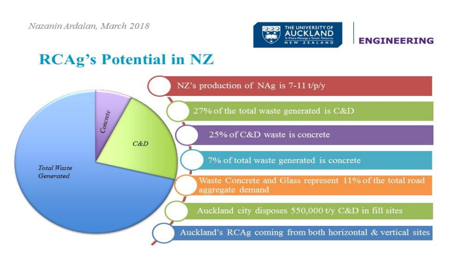
RAg as an alternative in road construction has not been widely accepted

Figure 1: RACg's Potential in NZ.