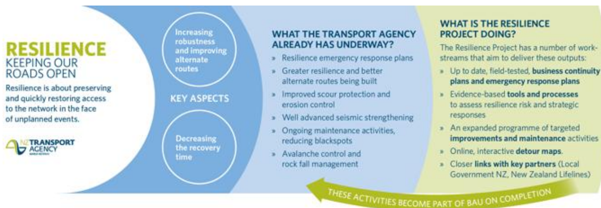
Figure 2.1: Resilience Business Improvement Project overview 3

In preparation for the various engagement sessions all Corridor Management Plans 4 and the National Transport Planning Overview (NTPO) 5 were also considered to provide an overview of resilience issues along key regional routes. Appendix A provides a summary of other relevant reports that have also been reviewed.