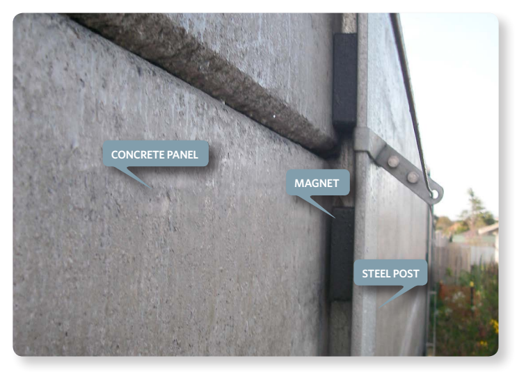
Ferrite magnets were used to pack gaps between noise barrier posts and panels

During manufacture, 70% of the first batch of concrete panels failed due to the collapsing of the elliptical voids within the panels. A standard 150mm hollow core panel was then selected to avoid this issue and due to this change only some of the noise barriers at Takanini have the De Vinci Lips. For visual consistency the standard hollow core panels had the 'Lips' painted on instead.