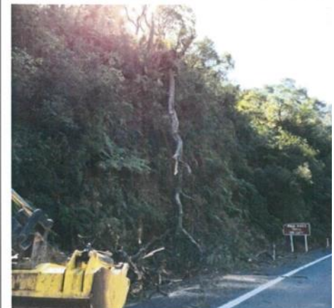
SH2 RS73/12885 – Tree hanging over carriageway