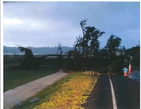
SH25 RS127/0.2 – Tree blocking road carriageway