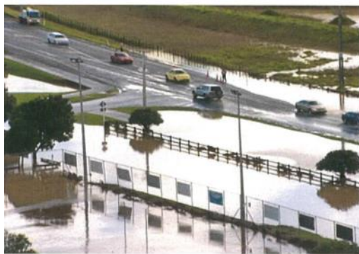
SH25 RS24/4300 – Flood waters receded enough to reopen to traffic

East Waikato 11-13 June 2014 Storm Event Funding Application