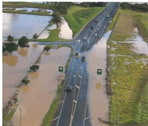
SH25 RS24/4300 – Flood waters receded enough to reopen to traffic