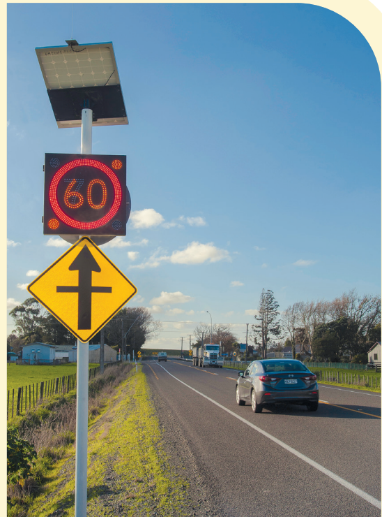
The VSL sign for the ISZ at North Rakaia Road and Weavers Road will look similar to this.

While ISZs have been approved for both sites, only the North Rakaia Road Variable Speed Limit (VSL) signs are being installed now. Installation of the Weavers Road VSL will be included in construction of the northbound CVSC site.