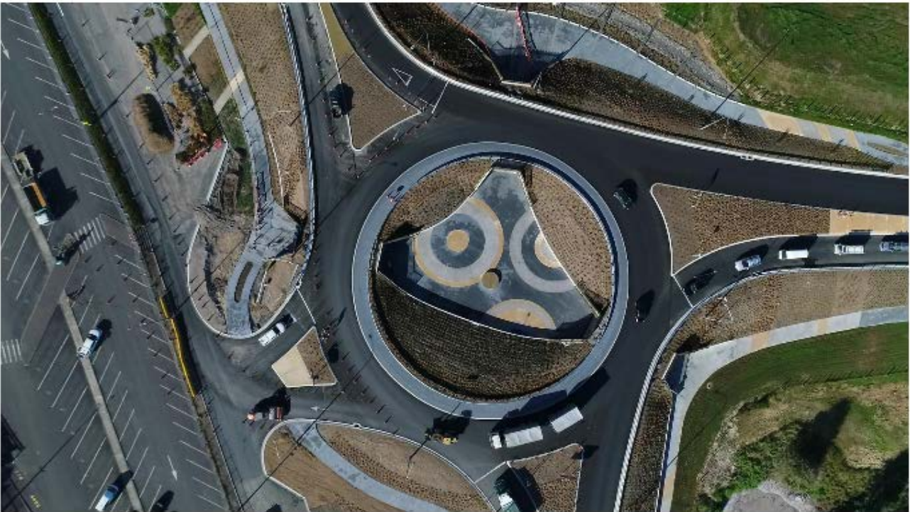
Hemo Roundabout, the artworks plinth in the small circle in the middle

Associated links below supplied for information only.