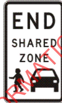
FIGURE 4: END SHARED ZONE TRAFFIC SIGN R 4-5