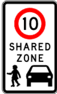
FIGURE 3: START SHARED ZONE TRAFFIC SIGN R 4-4

The traffic signs R 4-4 and R 2-10 shall be repeated at regular intervals if needed.