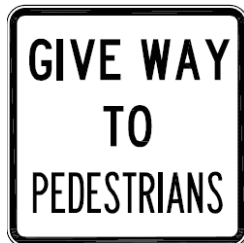
FIGURE 5: GIVE WAY TO PEDESTRIANS R 2-10