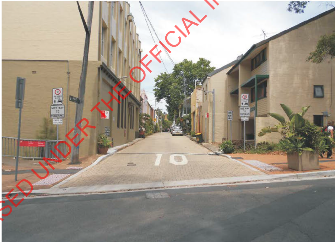
Figure 2. Photo and diagram of a Category 1 shared zone retaining kerb and gutter showing treatments, parking provision, and typical layout. The photo may have been modified to demonstrate essential elements.