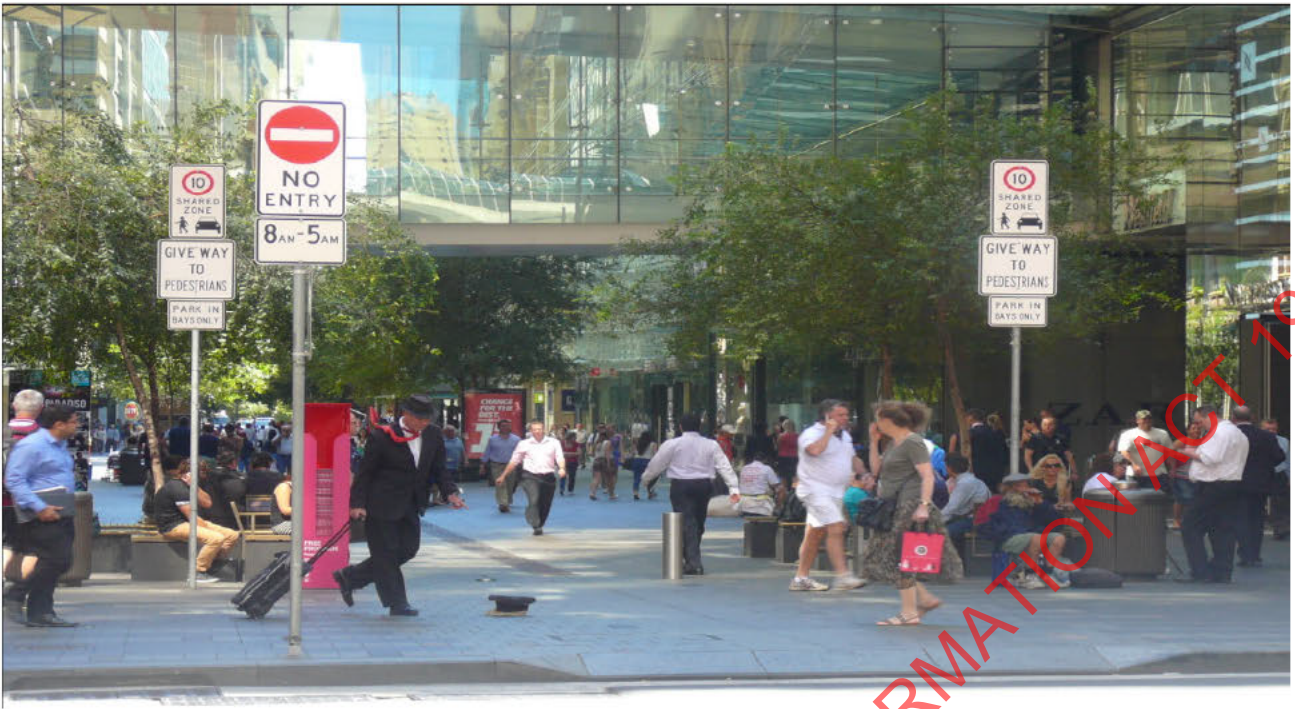
Figure 1. Photo and diagram of a Category 1 shared zone showing regulatory signage, typical layout and treatments. [Note: The No Entry sign is site specific] The photo may have been modified to demonstrate essential elements.