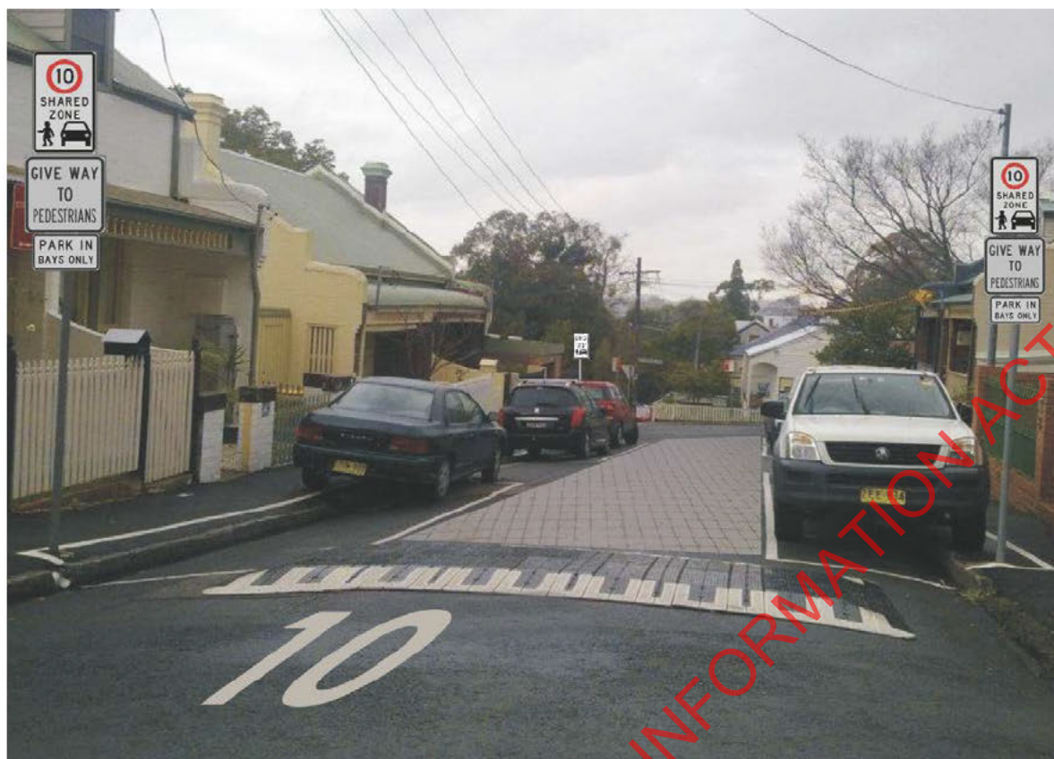
Figure 2. Photo and diagram of a Category 2 shared zone showing treatments, traffic calming, parking provision, and typical layout. 'Give Way' to Pedestrian' pavement marking is optional.

The photo may have been modified to demonstrate essential elements.