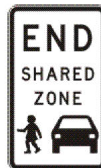
R4-5 END SHARED ZONE

Must be displayed at the end of the shared zone.