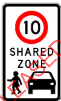
R4-4 SHARED ZONE

In shared zones, signs may be provided on both sides of the road, for one or two-way shared zones, to further enhance the changes in environment and priority.