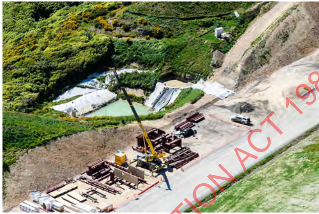
Headstock False Work