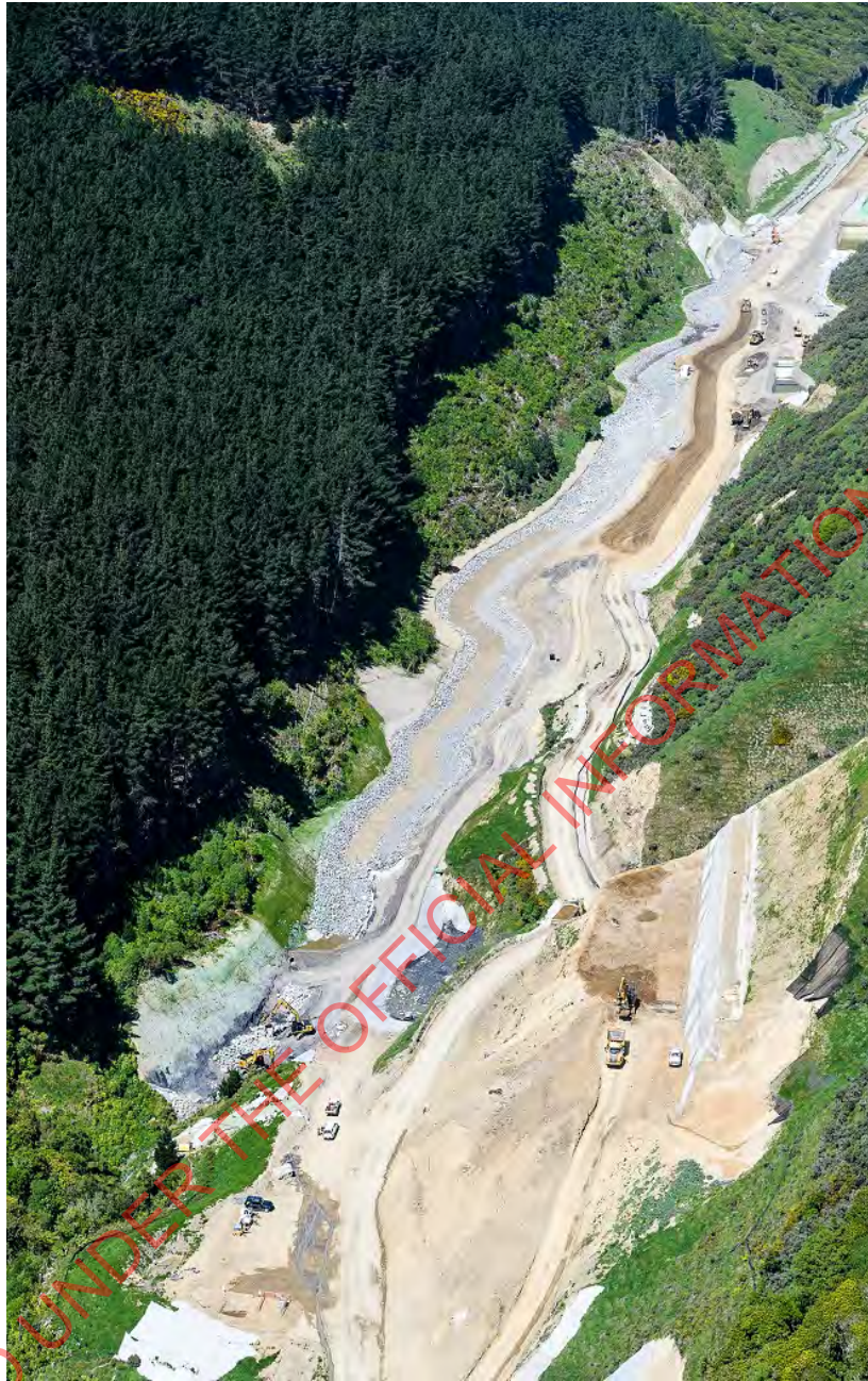
Te Puka 4 and 5