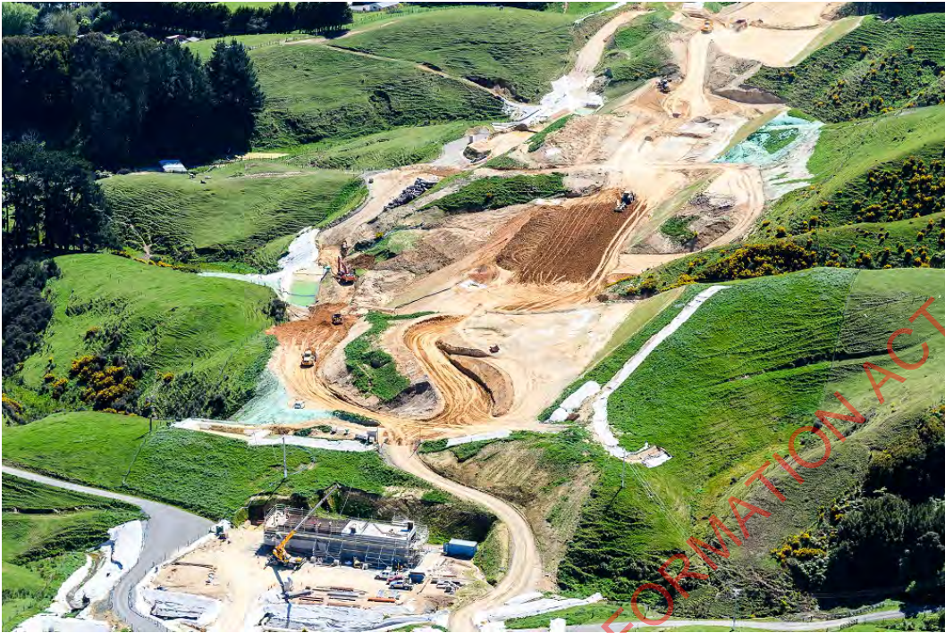
C2 – Earthworks