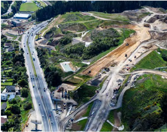
Scrapers – Fill 43