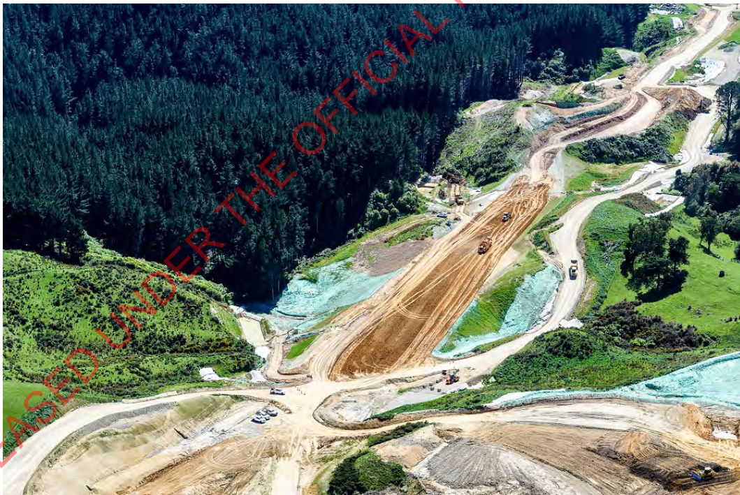
Zone C – Earthworks

RELEASED UNDER THE OFFICIAL INFORMATION ACT 1982