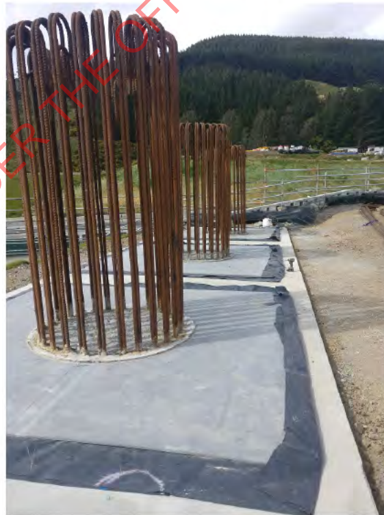
Bridge 25 – Abutment A, Start of Reinforcement

RELEASED UNDER THE OFFICIAL INFORMATION ACT 1982