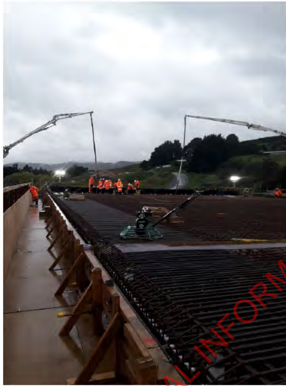
Bridge 13 – Deck Pour