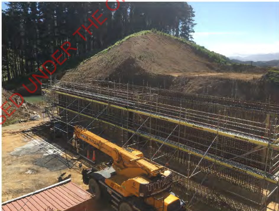
Bridge 18A – Wall Pour