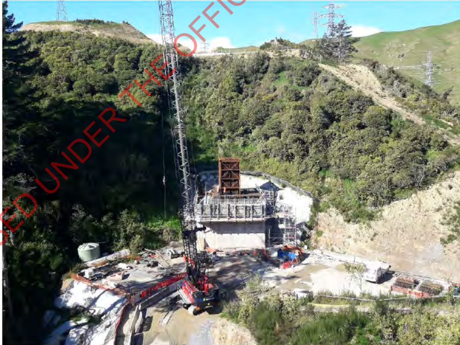
Bridge 20 – Pier 1, Foundation Pour