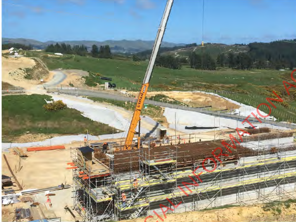
Bridge 11 – Roof Reinforcement