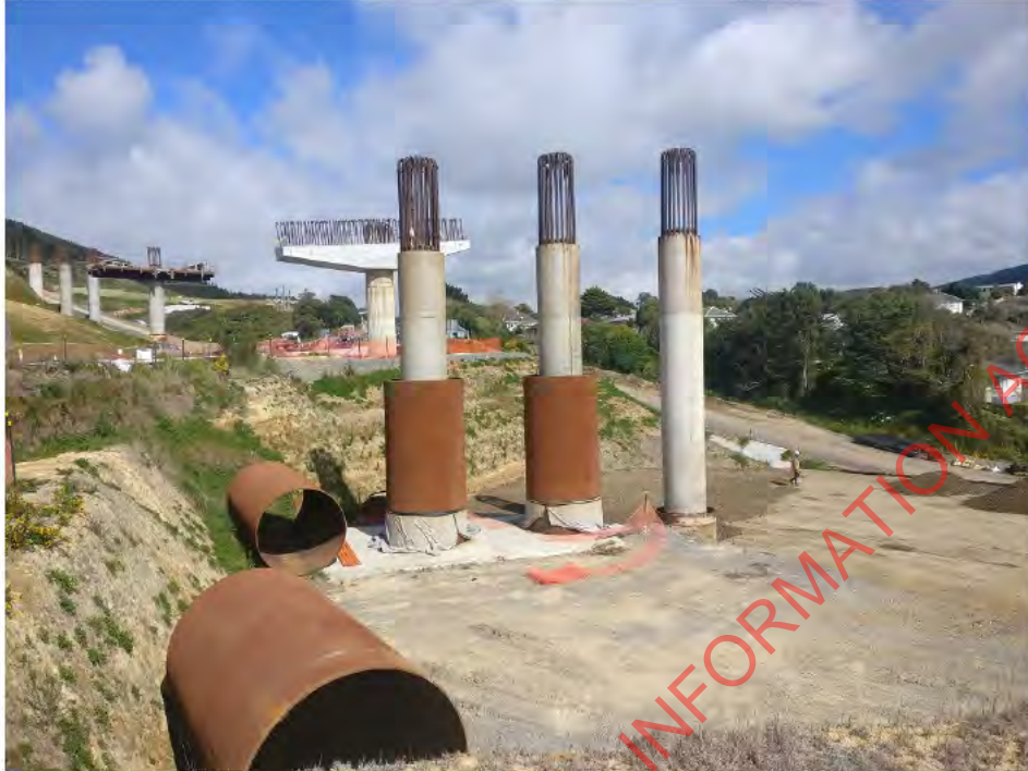
Bridge 27 – Abutment A