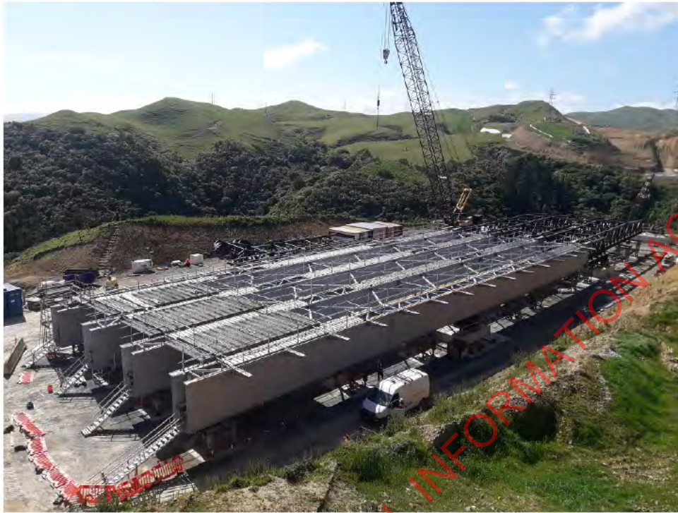
Bridge 20 – Super Structure