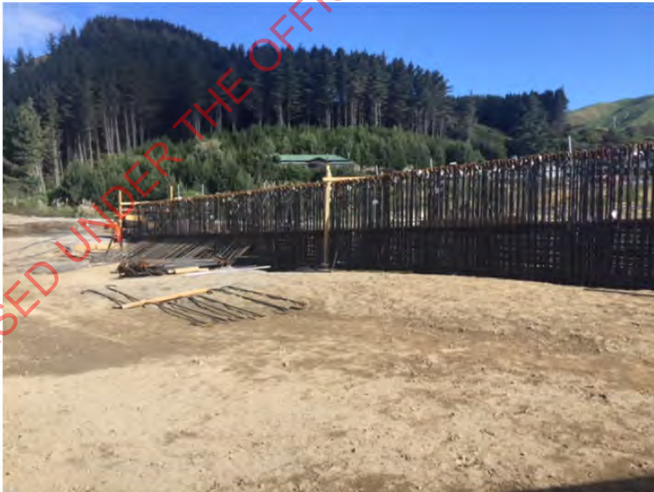
Bridge 2 – Abutment A, Reinforcement Fixing